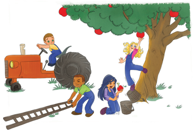
Group plan/own plan illustration.

In the story, the group plan was to pick apples. Evan followed his own plan and pretended to drive a tractor.